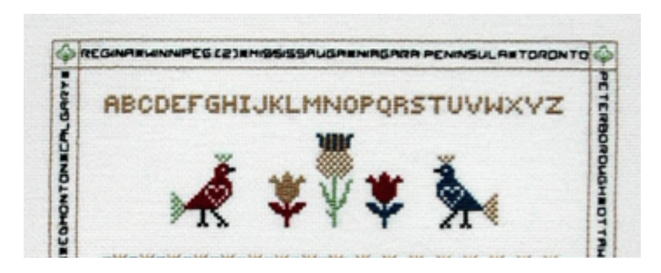
Detail showing bird and tulip motif

and various flower and bird motifs, all embroidered in cross stitch over one thread. The alphabet, all in upper case and five crosses high, is embroidered in the same gold floss as the border outline. The motifs below include two simple little tulip designs with a bigger bloom in the centre plus two small basic birds, all stitched in two strands of gold, red, green and navy floss. The legs and feet of the birds are black.